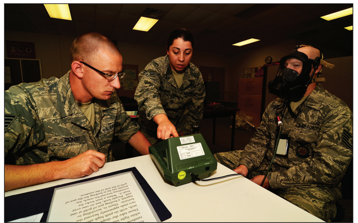
Take a deep breath...